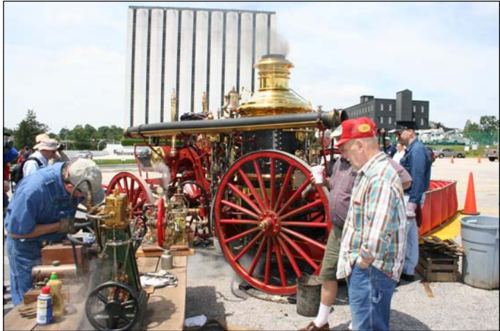
Left , the Motor Muster has grown into the Cruisin' for Our Heroes event and features machines built since 1911. Here is our oldest Mack "Bulldog" with its three high pressure pipes in service. Above the annual Steam Show is our longest-running event (31 years). Hand- and horse-drawn apparatus are featured along with the Museum's 1899 steamer. Model builders are invited to run their engines as well.