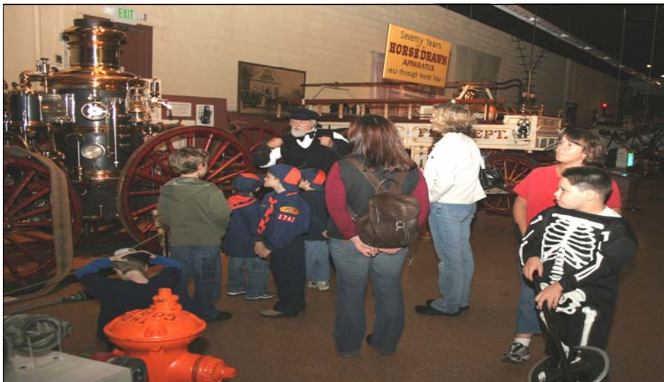
Above , Lantern Night is always a wonderful way to see the wheeled collections in a new light. Many lanterns, special electric lighting, and interpreters wearing period attire make this THE evening event to attend.