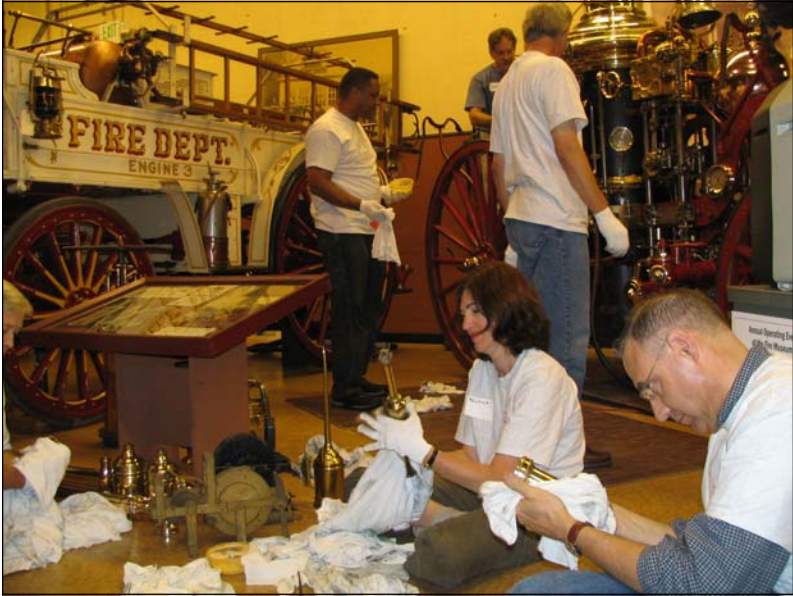
Above , Cleaning Day in March is critical to our "spotless" appearance. Special volunteers from Fireman's Fund help with the brass.